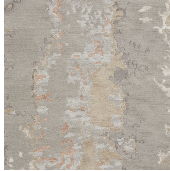
MAO HAND-KNOTTED WOOL & SILK 74962