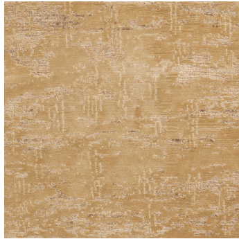
DURANZO HAND-KNOTTED ALLO & SILK 74956