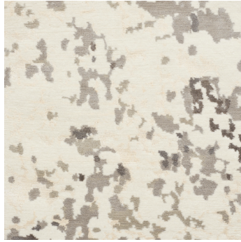
KETANO HAND-KNOTTED WOOL & SILK 74959