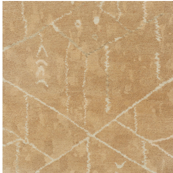
KUASAILA HAND-KNOTTED WOOL & SILK 71985