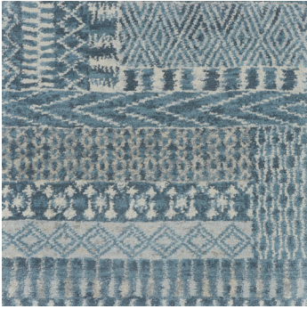
KASIM HAND-KNOTTED WOOL 71995