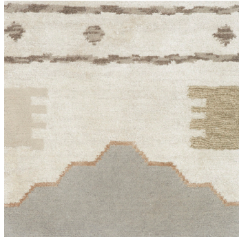
SHANI HAND-KNOTTED WOOL & BAMBOO SILK 72016