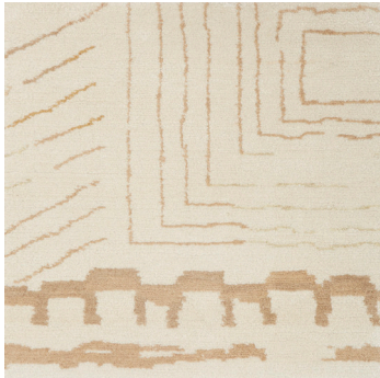
AZIBO HAND-KNOTTED WOOL & SILK 71993