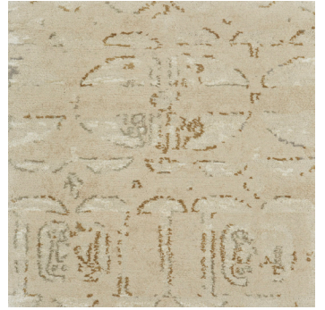
ANDALUSI HAND-KNOTTED WOOL & SILK 71987