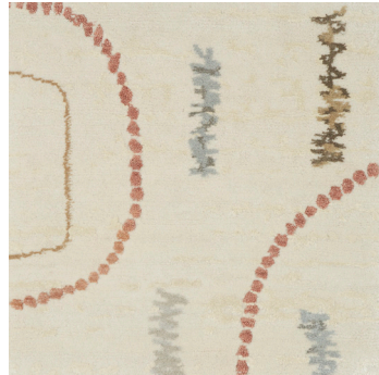
BATTUTA HAND-KNOTTED WOOL & SILK 71989

DON'T FORGET- ANY OF THESE PATTERNS CAN BE CUSTOMIZED!