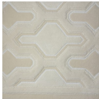
TANGIERS TILE HAND-TUFTED WOOL, SILK & VISCOSE 53873