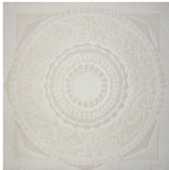
LAMIA HAND-TUFTED WOOL & SILK 53879