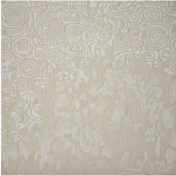
AMBROSIAL HAND-TUFTED WOOL & SILK 53883