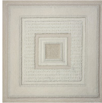
COAXAL HAND-TUFTED WOOL, SILK, LINEN & BAMBOO 53871