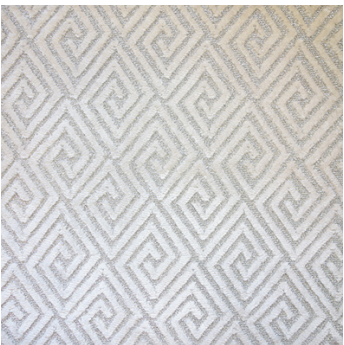
RESONANCE HAND-KNOTTED SILK & METALLIC THREAD 53847