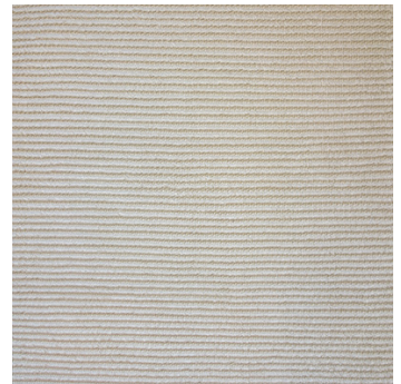
POINT BLANK TIBETAN SILK & BAMBOO 53859