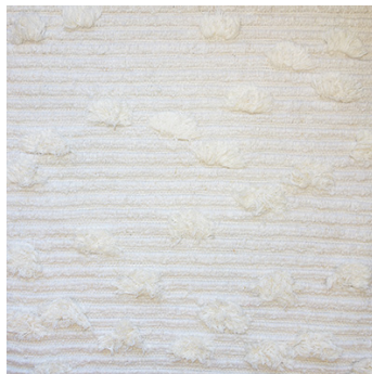
RIB INTERRUPT HAND-KNOTTED BAMBOO & ALLO 53849