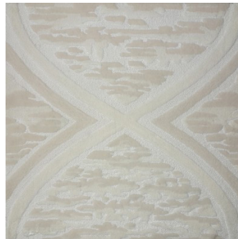
LUITPRAND HAND-TUFTED WOOL & BAMBOO 53885