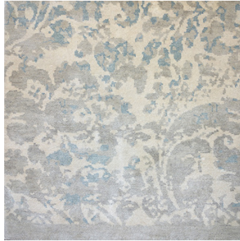
ANGELIQUE HAND-KNOTTED SILK 53841