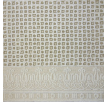
GRAPHIQUE HAND-TUFTED WOOL & BAMBOO 53877