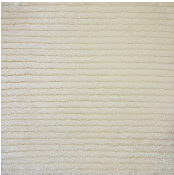
INFINITUDE HAND-KNOTTED WOOL & SILK 53858